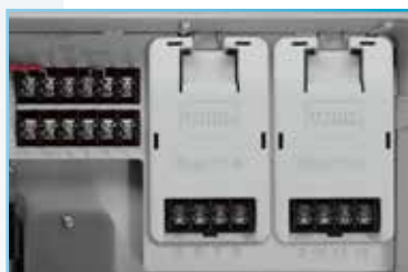
12-station configuration with (2) 4-station modules