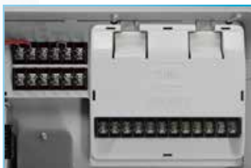
16-station configuration with (1) 12-station module