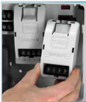
Modular configurations from 4 to 16 stations